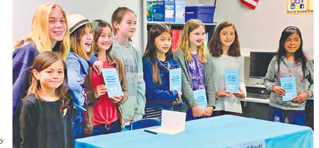
Student Authors at Wiley Canyon

This year, more students have expressed an interest in joining the writing and book club. We are very excited to read the next collection of stories written by our students!