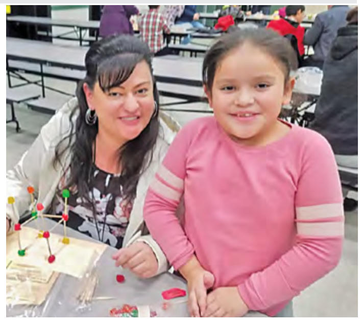
Family Engagement Activities

We are excited to start the year and make a positive difference in the lives of our students!