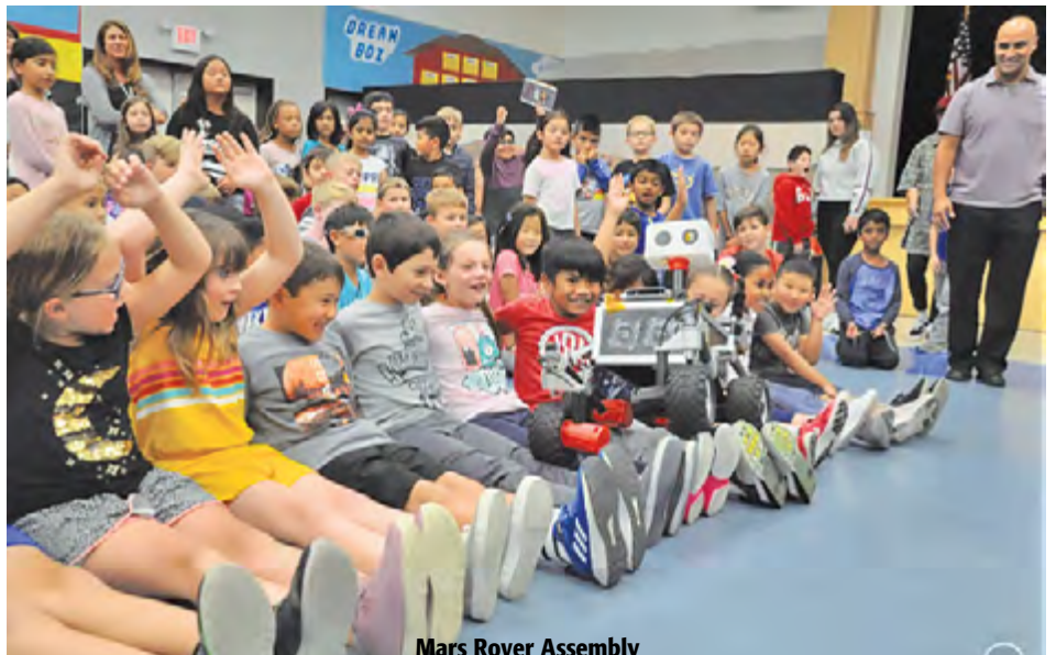
Mars Rover Assembly

With the help of our parent-led Science Booster program, and the Oak Hills Foundation, we will also continue our partnership with NASA’s Jet Propulsion Laboratory (JPL), which provides us with both field trips and guest speakers.