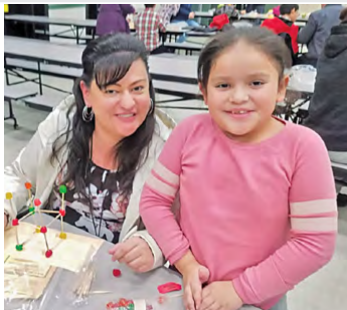
Family Engagement Activities

We are excited to start the year and make a positive difference in the lives of our students!