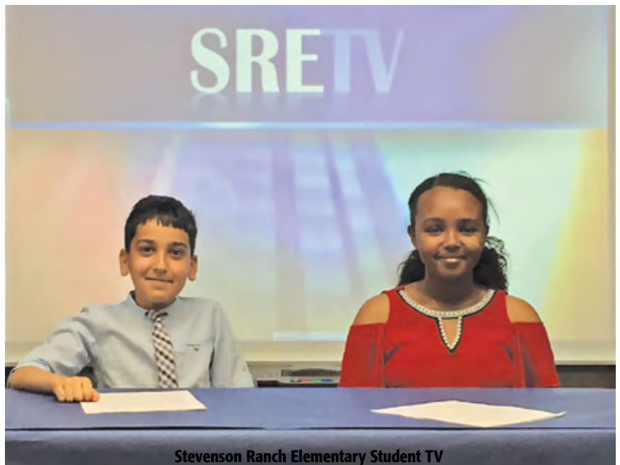
Stevenson Ranch Elementary Student TV

The goal of the Innovations program is to encourage every student's journey in becoming an innovator by inspiring ingenuity, exploring different perspectives, and creating original works. Sixth-graders, for example, become newscasters by writing, producing, and editing video news reports tied to their social studies and science standards. Third-grade animators create Claymations to explain life cycles. Students in the first grade attend space camp as they become astronauts.