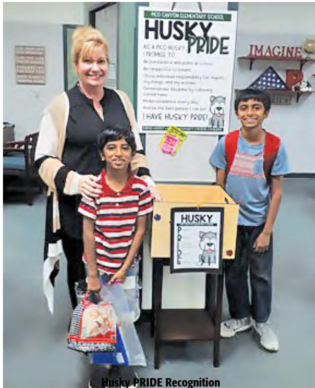
Husky PRIDE Recognition

Academic optimism and the belief that all students can learn and grow is felt in every classroom and is discussed in every grade-level collaborative meeting, staff meeting, PTA meeting, and Instructional Leadership team meeting. All adults work to create a student-centered community from the moment a child steps onto our campus.