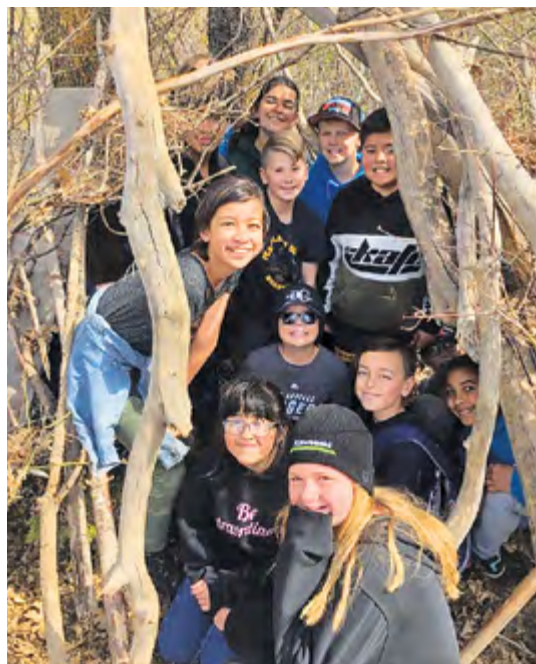
Peachland GATE Field Trip

¡Esperamos un excelente año escolar 2019-20!