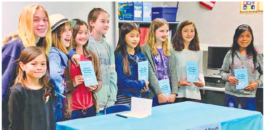
Student Authors at Wiley Canyon

This year, more students have expressed an interest in joining the writing and book club. We are very excited to read the next collection of stories written by our students!