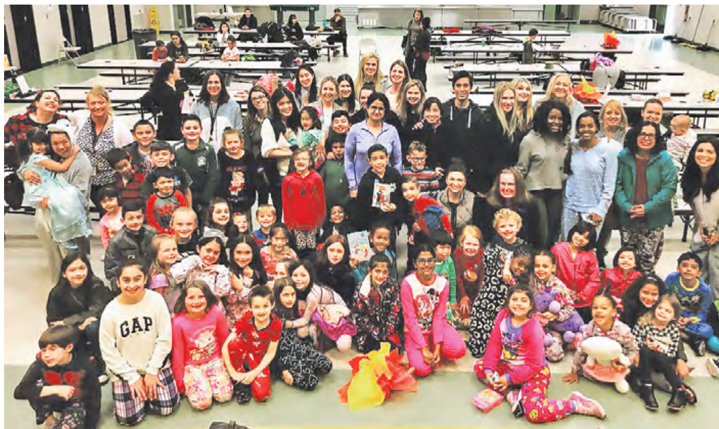
Pico Canyon Literacy Night

Volume 1, Issue 1 September / October 2019