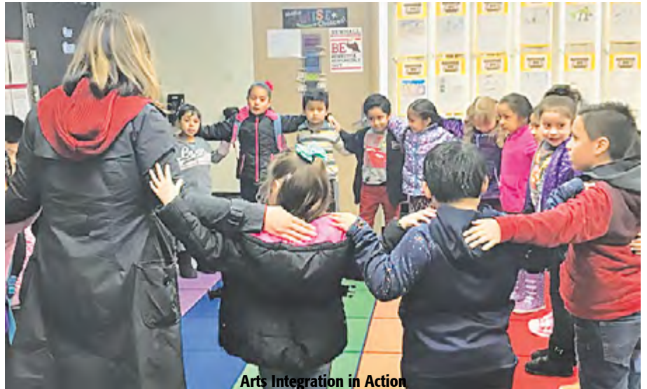
Arts Integration in Action

Inspired by the Kennedy Center’s Arts Integration Conference last June, teacher established a site collaborative and a school-wide theme—The Art of Possibility—which was created to support arts integration implementation. Newhall Elementary teachers are excited about sharing strategies and collaborating to teach both art forms and curriculum to engage students in learning.