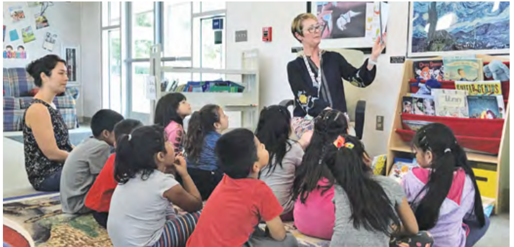
A group of primary newcomer students visiting the library.

The Newcomer program at Newhall Elementary has been designed to meet this student community's needs as they develop linguistic survival skills and start adapting to the new culture. Students meet four times a week with certificated teachers to develop beginning English language skills, acclimate to the school system, learn about classroom environment and learning, and build confidence.